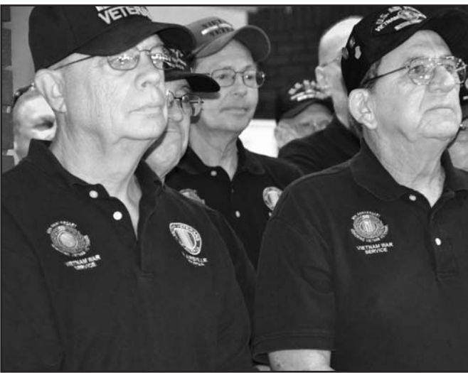
Nearly two dozen Vietnam Veterans gathered for the unveiling of the display on Saturday – many tears were shed that morning.